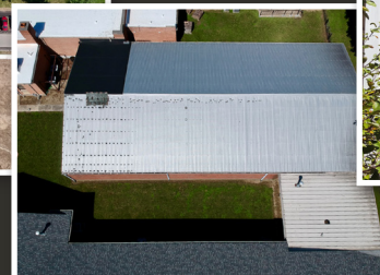
Roof repairs and replacement