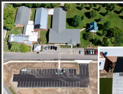
New parking lot